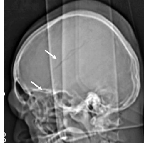
Figure 2. CT scan tomogram showing linear fracture of temporal and parietal bones (arrows)